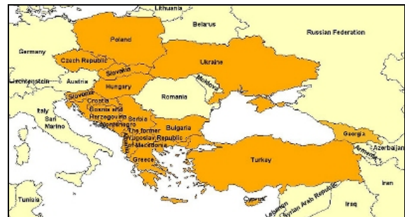
Figure 2: ECSEE Division countries

Georgia joined ECSEED (see Fig. 2). Before that, Montenegro was accepted into the ECSEED in 2008 during the 19th ECSEED session in Zagreb. The ECSEE Division has now 17 countries active (see Table 1).