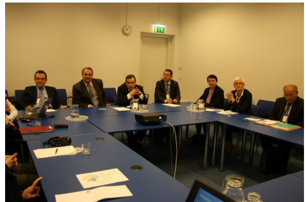
Figure 1b: ECSEED meeting

The East Central and South-East Europe Division (ECSEED) organized a meeting during the 26 th UNGEGN Session (2 - 6 May 2011, UN Center Vienna). The ECSEED meeting was held on the 4th May in the UN Center Vienna. The meeting was attended by 14 representatives: Croatia (1), Cyprus (2), Georgia (3), Greece (1), Poland (3), Slovenia (1), the former Yugoslav Republic of Macedonia (1) and Turkey (2) (see Fig. 1). The last 20th ECSEED Session was held a few months before, in February 2011 in Zagreb. But, during that period there were important Division activities.