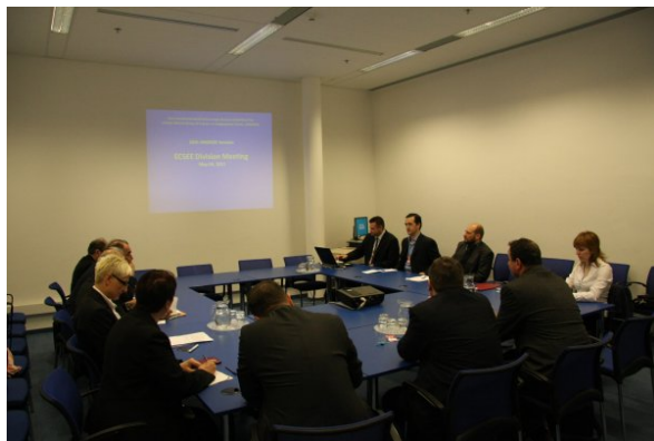
Figure 1a: ECSEED meeting

Georgia joined ECSEED (see Fig. 2). Before that, Montenegro was accepted into the ECSEED in 2008 during the 19th ECSEED session in Zagreb. The ECSEE Division has now 17 countries active (see Table 1).